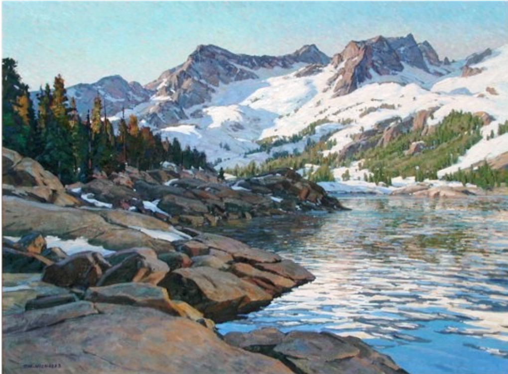
Morning at South Lake Oil T.M. Nicholas